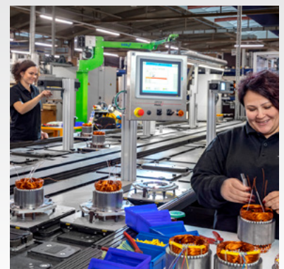
Motor production in the '20s