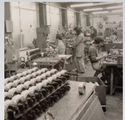
Motor production in the '60s

Our motors are IP55 certified, which means that it's impossible for large amounts of spray water or dust to enter the motor. Because of condensation alone, however, about 0.5 liters of water flows through the motors annually. It is therefore essential that moist air can escape from the motor. We have developed special drainage channels for this purpose, which considerably extends the service life of our motors.