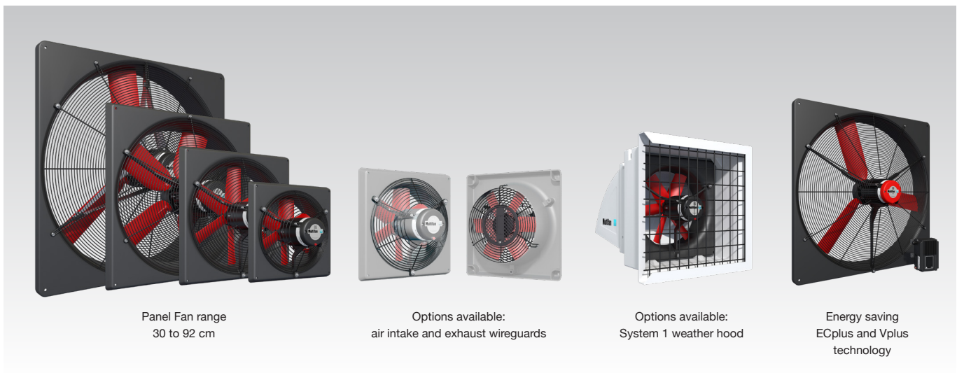
Panel Fan range 30 to 92 cm