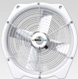
45 cm Horizontal Circulation Fan