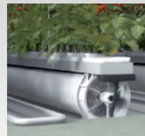
Simple to attach air hoses